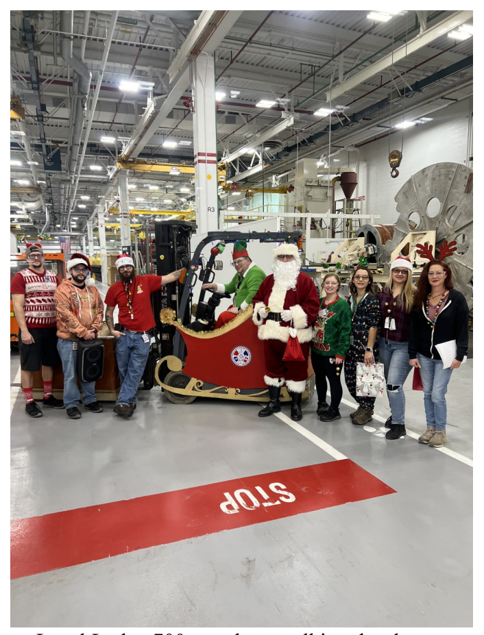
Local Lodge 700 members walking the shop to collect donations for the Toy Drive